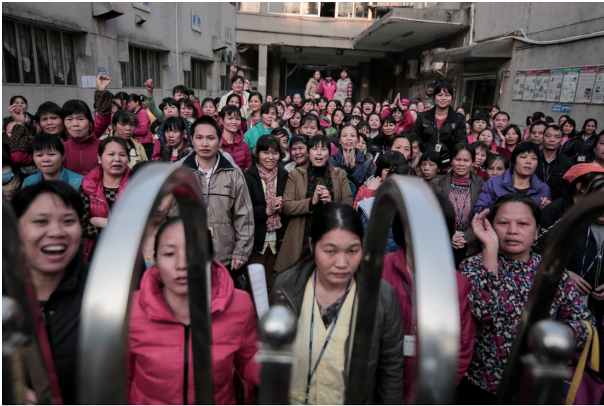
Workers staged a strike at a garment factory to fight for pension benefits in Shenzhen, Guangdong province.

GUANGZHOU, China—For four years, a labor-research center here in the heart of China’s southern manufacturing belt helped to drive scholarship and debate on